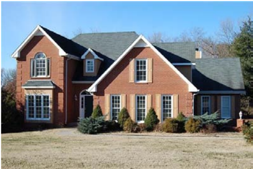
One of the many homes available in the Nashville suburbs of upscale Sumner County for under $205K with over 2400 square feet of living space.

Electric rates for Cumberland Electric are less than half per kilowatt hour than those charged by the Long Island Power Authority.