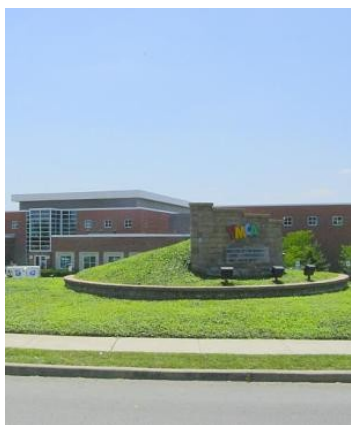
The Sumner County YMCA in Hendersonville, Tennessee

The Orlando area also has an over-supply of hotel space with 4 star hotels going for as little as $52 per night through Hotwire.com.