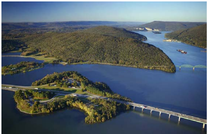
Interstate 24 crosses the Tennessee River, near Chattanooga

Having a son and grandchild in Orlando, Florida