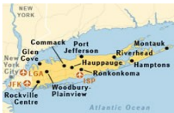
Long Island, New York — Our home for over sixty years. We left for Hendersonville, TN in 2005.